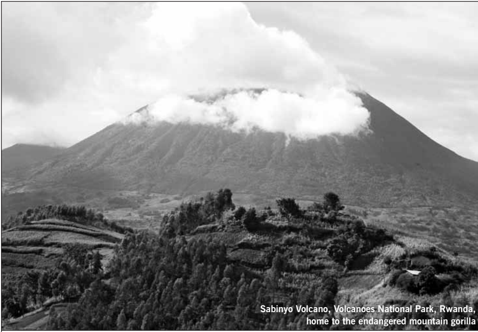
Sabinyo Volcano, Volcanoes National Park, Rwanda, home to the endangered mountain gorilla